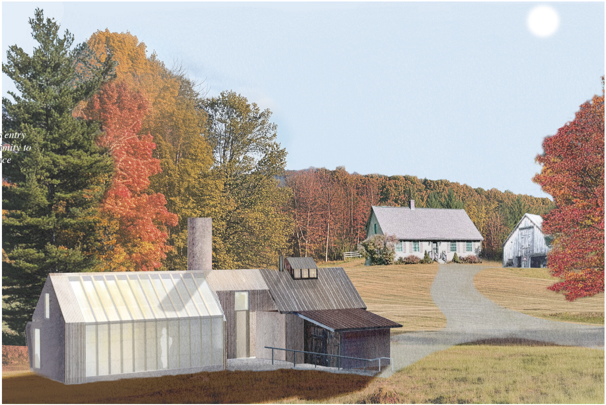
Sugar Onwards entry as seen in proximity to primary residence