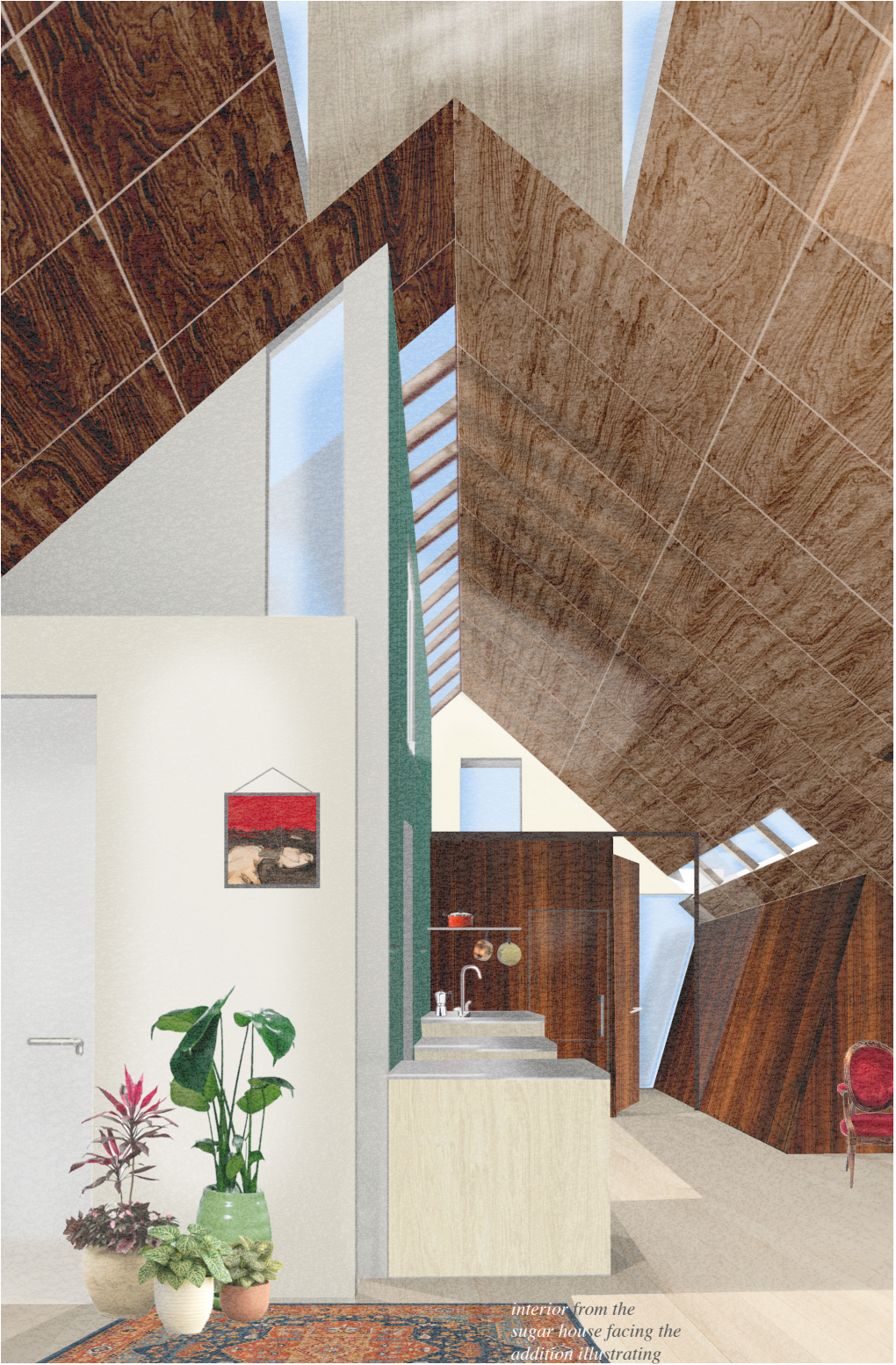
interior from the sugar house facing the addition illustrating the variability of the potential finishes with the complementary 16ft- tall hiped roof ceiling