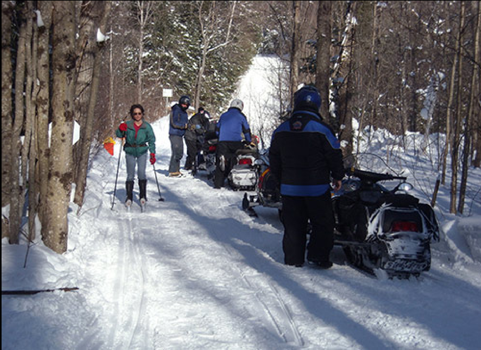
A Nordic skier and snowmobiler share the Presidential Range Trail in Jefferson, NH.